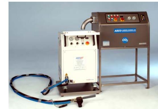
Automatic filling of a storage container respectively of a dry ice blasting machine

The optional automatic filling system, with the appropriate control system, allows a preset low dry ice level to automatically start the dry ice pelletizer, with automatic stop at the preset high level. For industries like tyre/rubber manufacturers, producers of PU-parts, foundries etc. who need to clean moulds, a stationary dry ice blasting system is often required, and this higher level of automation is ideal.